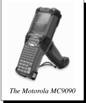
The Motorola MC9090

Partnering with AbeTech made their "easy" decision into an easy implementation too. Their RF data collection system is a reality that is already paying off.