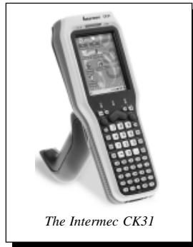
The Intermec CK31

The CK31 also offers a variety of other enticing features, such as a full quarter VGA touch screen, multiple keyboard options, various options for imaging and short- or long-range scanning, and a removable pistol grip. All of these make the CK31 easy for your end-users whether they're in the warehouse or in the field. From a technical standpoint, your IT staff will be happy to hear that the CK31 contains a Wi-Fi certified